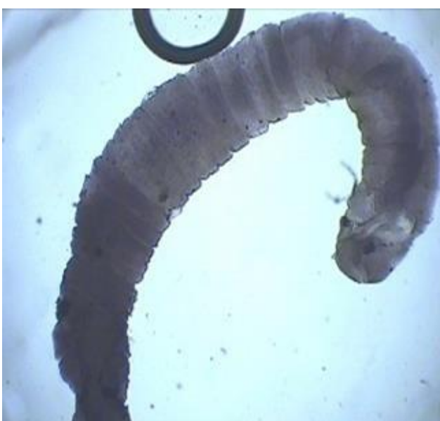
Plate 3: Anterior view of cestode under a microscope

Nematodes, cestodes, and trematodes were discovered to be the most prevalent types of helminths in both fish species, and the analysis revealed that C. gariepinus had a larger helminth burden than T. zilli . The prevalence of parasite infection was shown to be associated with fish length and weight, with bigger and heavier fish exhibiting a higher sensitivity to helminth infestation. The incidence of parasites in the Zobe Dam was also linked to environmental conditions, including how farmers dispose of their garbage and feces.