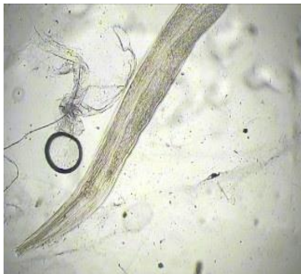
Plate 1: Anterior view of Nematode under a microscope