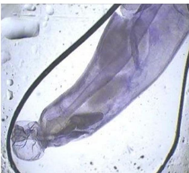
Plate 2: Posterior view of trematode under a microscope