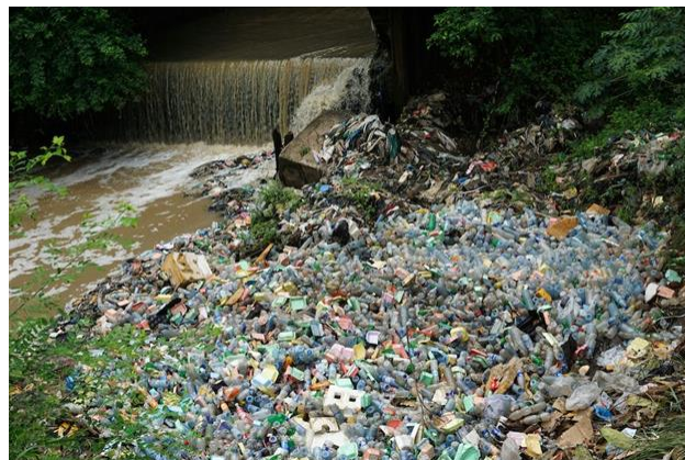
Plate I: Source of plastic pollution from a Lagoon in Lagos, Lagos State Nigeria (Ekpei, 2023).

on them, identifying the sources of microplastic waste is essential. In Nigerian freshwater bodies, there are numerous sources of microplastic waste (Akindele et al. , 2019). Lack of recycling and poor waste management practices are frequently to blame for MP contamination in Nigeria as it was shown (Plate I) in Lagos lagoon of Nigeria, and many places of West African nations (Akindele et al. , 2019).