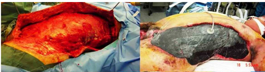
Figure 3: Abdominal and chest necrotizing fasciitis.

Figure (A) shows necrotizing fasciitis of left upper limb before surgical debridement while figure (B) after the debridement in the theatre. Figure (C) shows necrotizing fasciitis of the left lower limb before surgical debridement while figure (D) after the debridement.